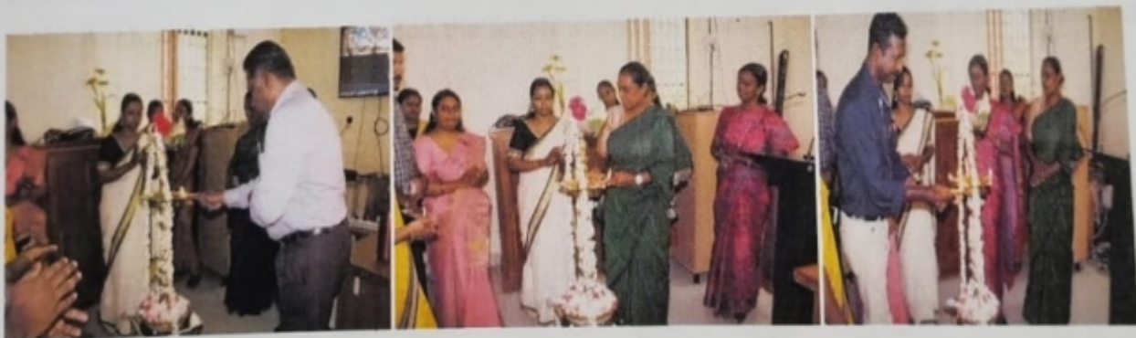
Inauguration of the International Seminar